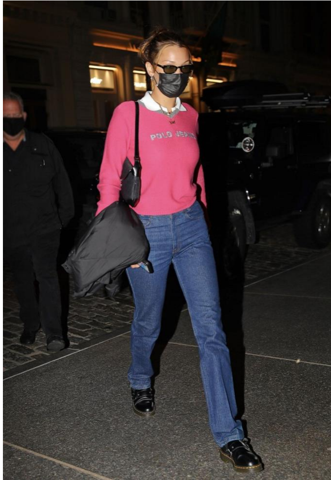
Bella Hadid walking the New York in vintage “Polo Jeans” sweater and “Ghost Sling” bag by Balenciaga

The rise of thrifting and vintage clothing has to do with the fact of the fashion industry and the major issues faced with sustainability. Bella is one of society’s major style icons right now, and her nod to the Y2k era brings more awareness to apps like Depop where the latest vintage pieces can be found instead of shopping fast fashion.