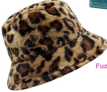
Fuzzy Cheetah Bucket Hat KINGSEVEN $9.66 amazon.com