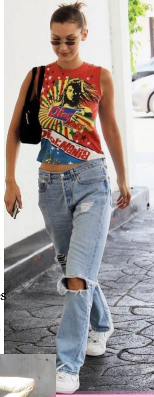
Supermodel Bella Hadid rocking rectangle sunnies and baggy ripped jeans