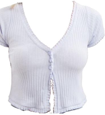
Half Button T-Shirt PacCares $22.96 PacSun

Somebody call Paris Hilton because the early 2000's are back and better than ever! These pieces will "spice up" your closet, keeping your style urban even if these trends were hot 20 years ago.