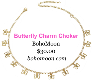
Butterfly Charm Choker BohoMoon $30.00 bohoomoon.com