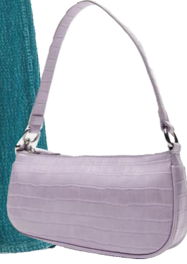
Croc Baguette Bag UO $39.00 Urban Outfitters