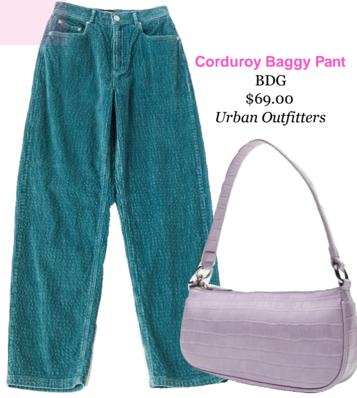
Corduroy Baggy Pant BDG $69.00 Urban Outfitters